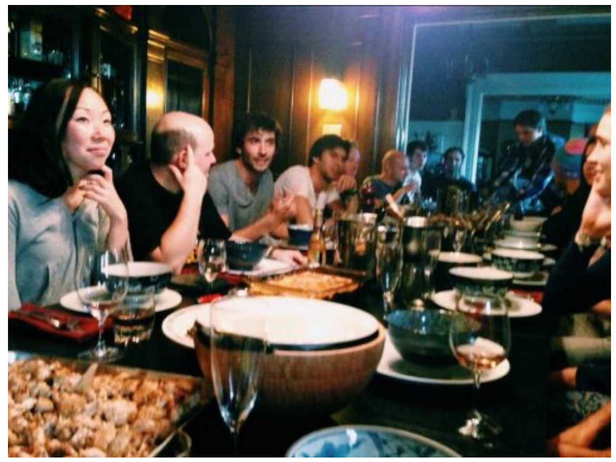
March 13, 2019