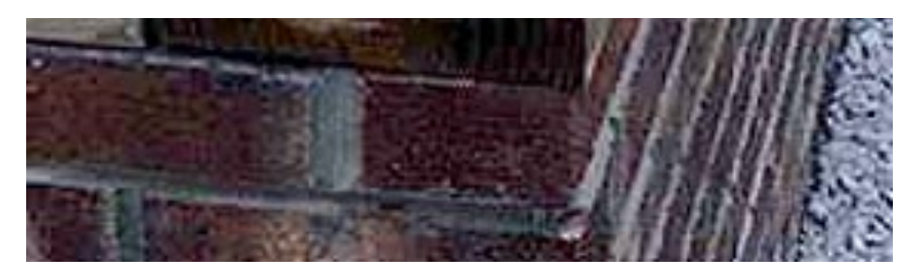
April 5, 2017